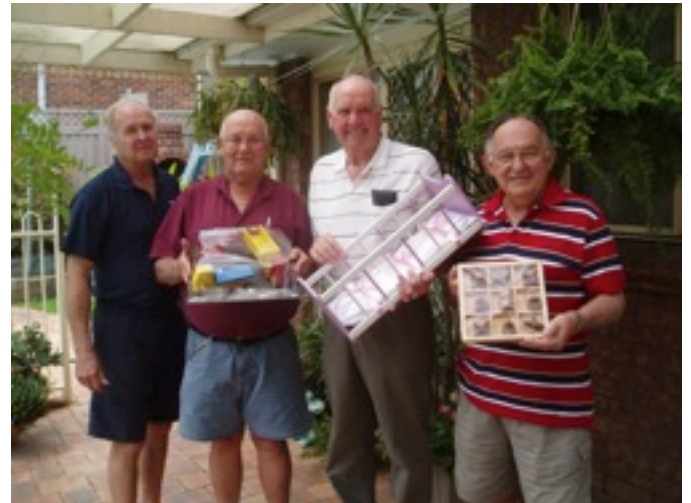
Above: Presenting three sets of toys to Nepean & Blue Mountains Cardiac Support Group for their annual raffle.