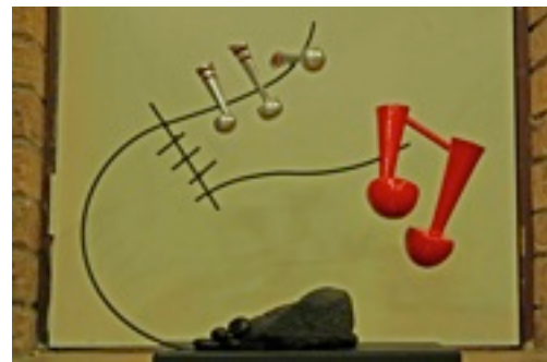
Da da da DAH!!!