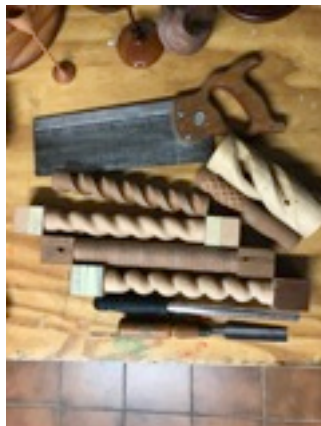
Some Photos from John Krook's demonstration last month