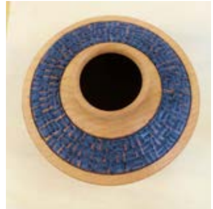
Des T Demo