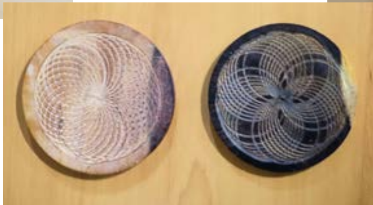
Magic Mushroom Graffiti