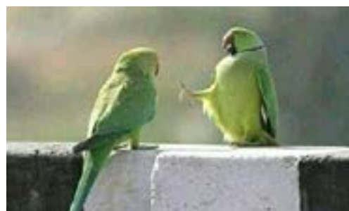
Social Distancing is for everyone

ernieman@hotmail.com Mobile: 0416961063.