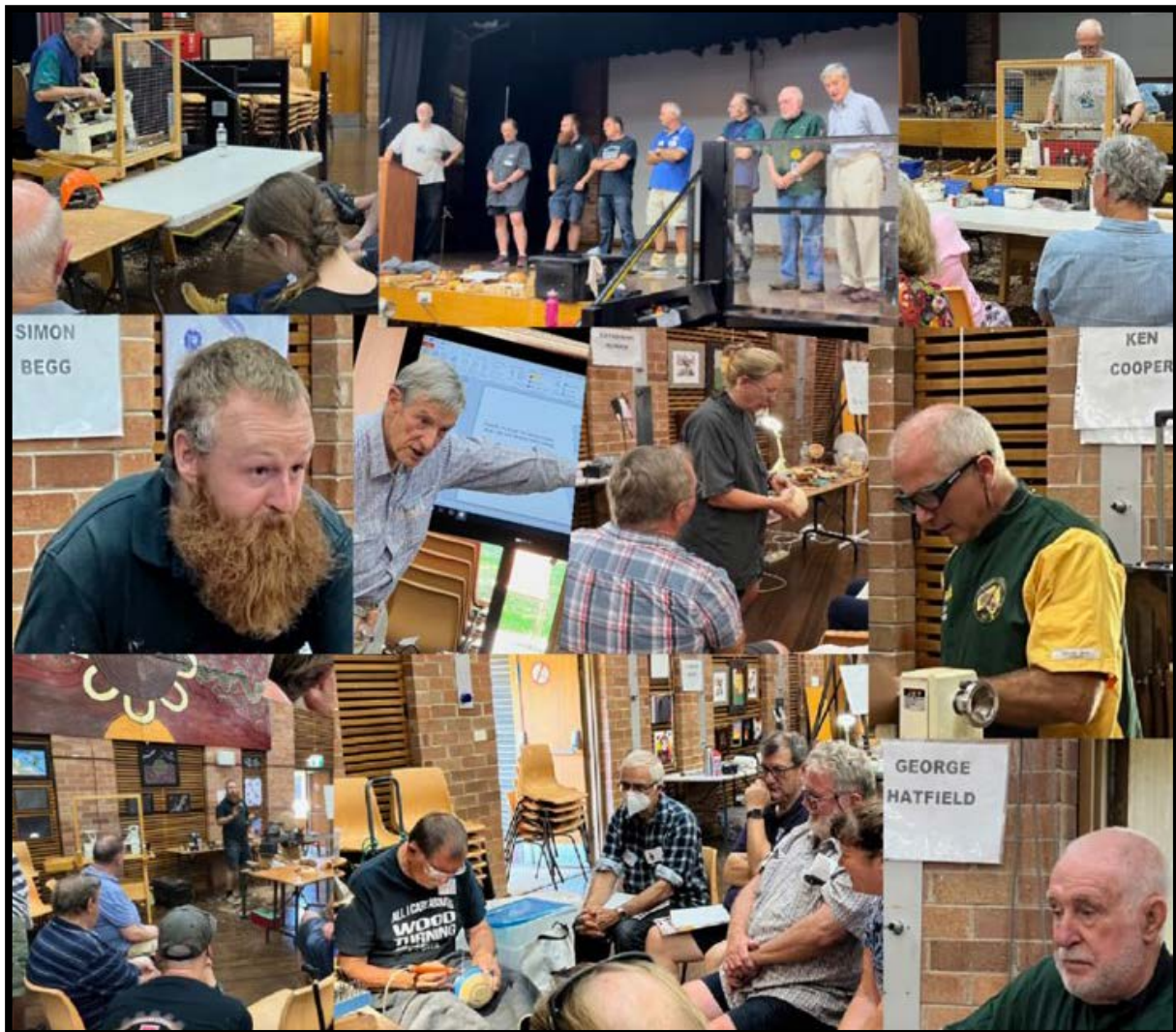
Photos from the 2023 Mini Symposium